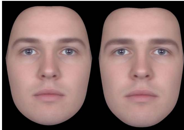
Figure 1 Feminised (left) and masculinised (right) male faces used in Study 1. Similarly transformed faces were used in Studies 2 and 3.

adults had the brief procedure explained to them and it was the supervising adults who then administered the test to the children they were supervising. Participants were asked to tick whether they were a female/girl or male/boy and then tick which face they preferred. On each sheet were written instructions: "Tick which face of each pair you prefer". Faces were presented counterbalanced by side (i.e. half of the sheets had the masculine face on the right and half had the masculine face on left).