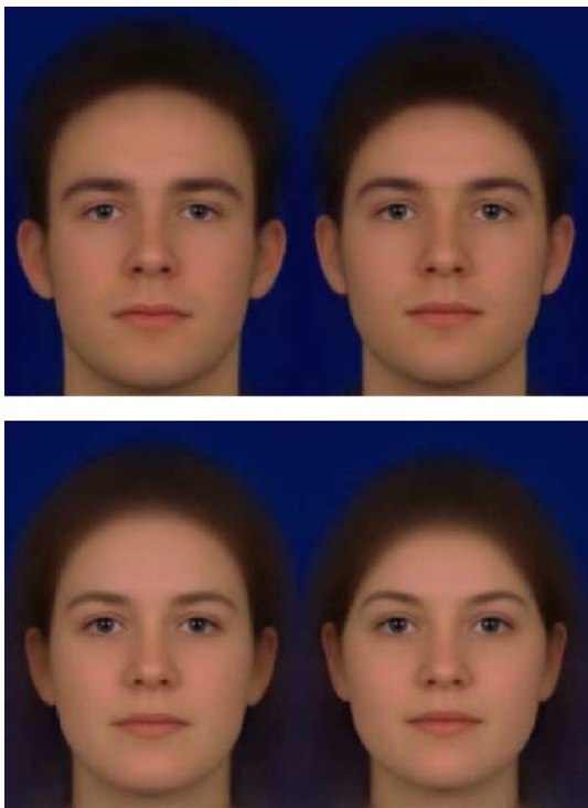
Fig. 1. Male (top row) and female (bottom row) face images manipulated to increase (left) and decrease (right) masculinity of shape (sensu Penton-Voak et al., 1999; Perrett et al., 1998).

Days since last period of menstrual bleeding were converted to predicted progesterone and estrogen levels (using values from Alliende, 2002; sensu DeBruine et al., 2005). Estrogen and progesterone levels were estimated from plots of mean urinary estrone glucuronide and pregnanediol glucuronide in Alliende (2002). Values were measured using custom-programmed graph digitizing software (similar to the commercially-available "DigitizeIt").